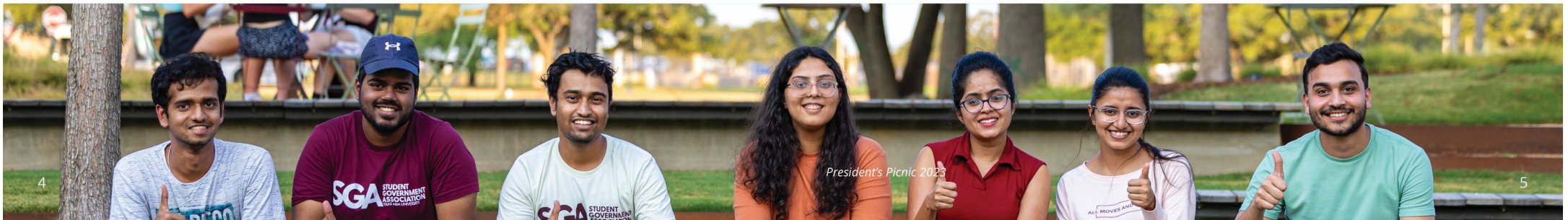
President's Picnic 2023