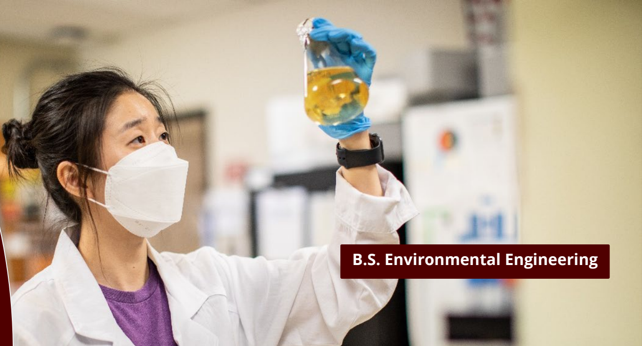
B.S. Environmental Engineering