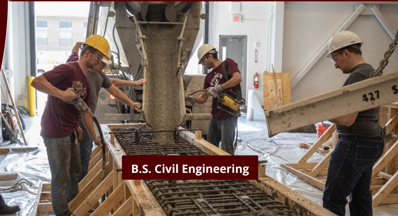
B.S. Civil Engineering